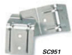
SC951 Wall Hooks